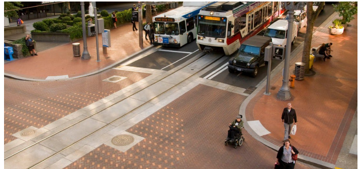
Landscape architects plan and design transportation corridors that consider all users of the roadway—cars, cyclists, pedestrians, mass transit riders, and more. Firm: ZGF Architects LLP.

Landscape architects help communities by designing multiuse transportation corridors that accommodate all users, including pedestrians, bicyclists, motorists, people with disabilities, and people who rely on public transportation. These systems reduce reliance on single-use automotive transport, which in turn reduces traffic, improves air quality, and promotes a more active way of life.