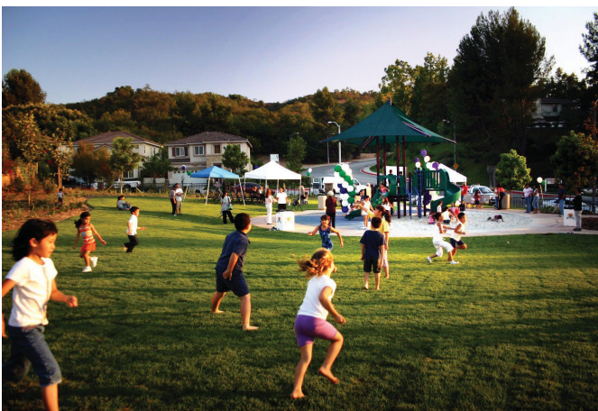
Landscape architects design recreation facilities that keep children and families active and healthy, such as this neighborhood playground in West Covina, California.

Landscape architects design communities that support active and healthy lifestyles by linking homes, schools, businesses, parks, and recreation facilities together with walking and bicycle paths and sidewalks that provide safe and easy alternatives to driving.