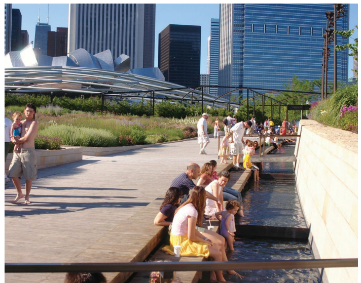
Lurie Garden in Chicago's Millennium Park is an iconic example of landscape architecture. Firm: GGN.

Landscape architecture is regulated by state licensure requirements. Becoming licensed generally requires a university degree in landscape architecture and completion of a period of supervised practice. All states require passage of the extensive four-part national licensing examination.