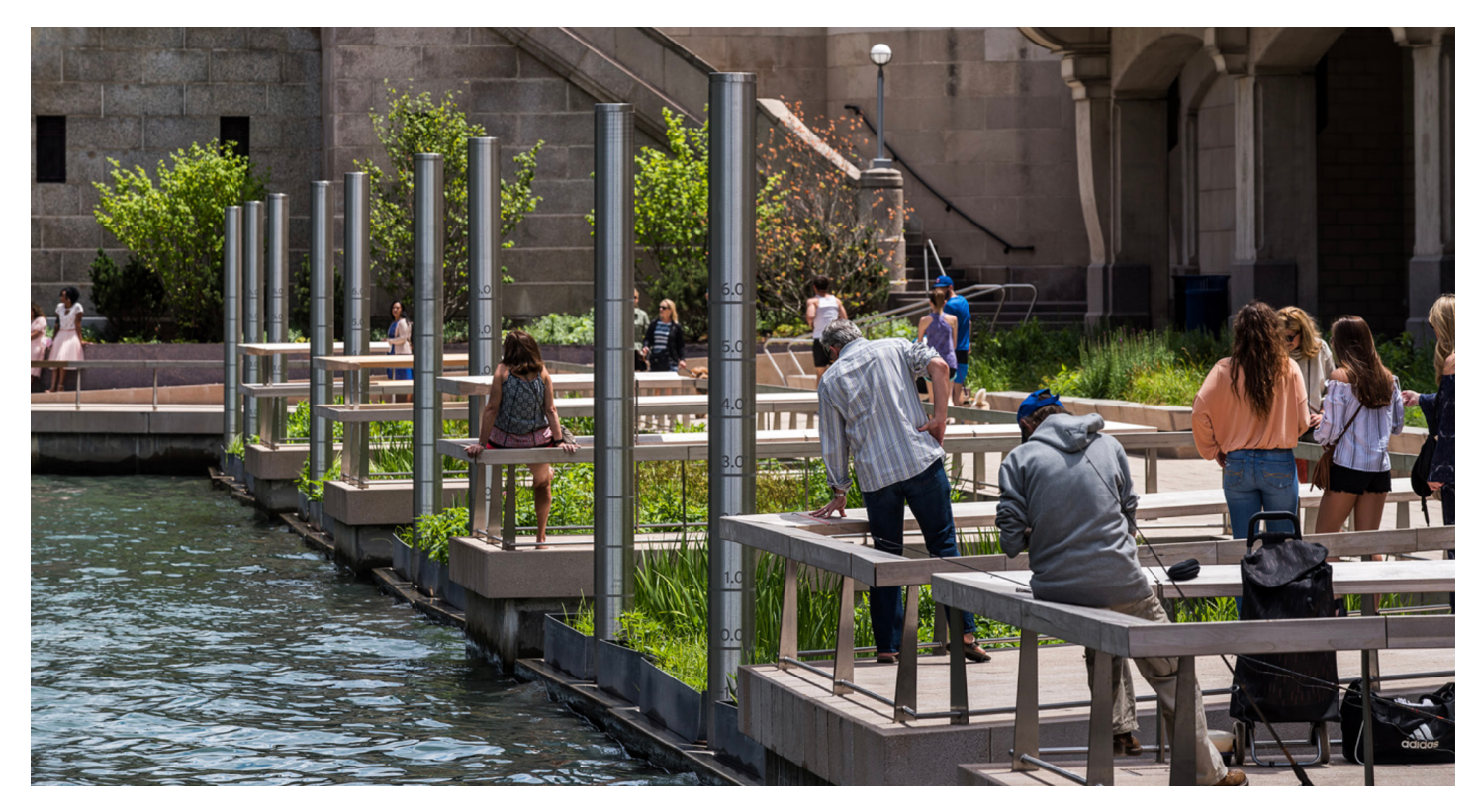
ASLA 2018 Professional General Design Honor Award. Chicago Riverwalk | State Street to Franklin Street. Sasaki and Ross Barney Architects