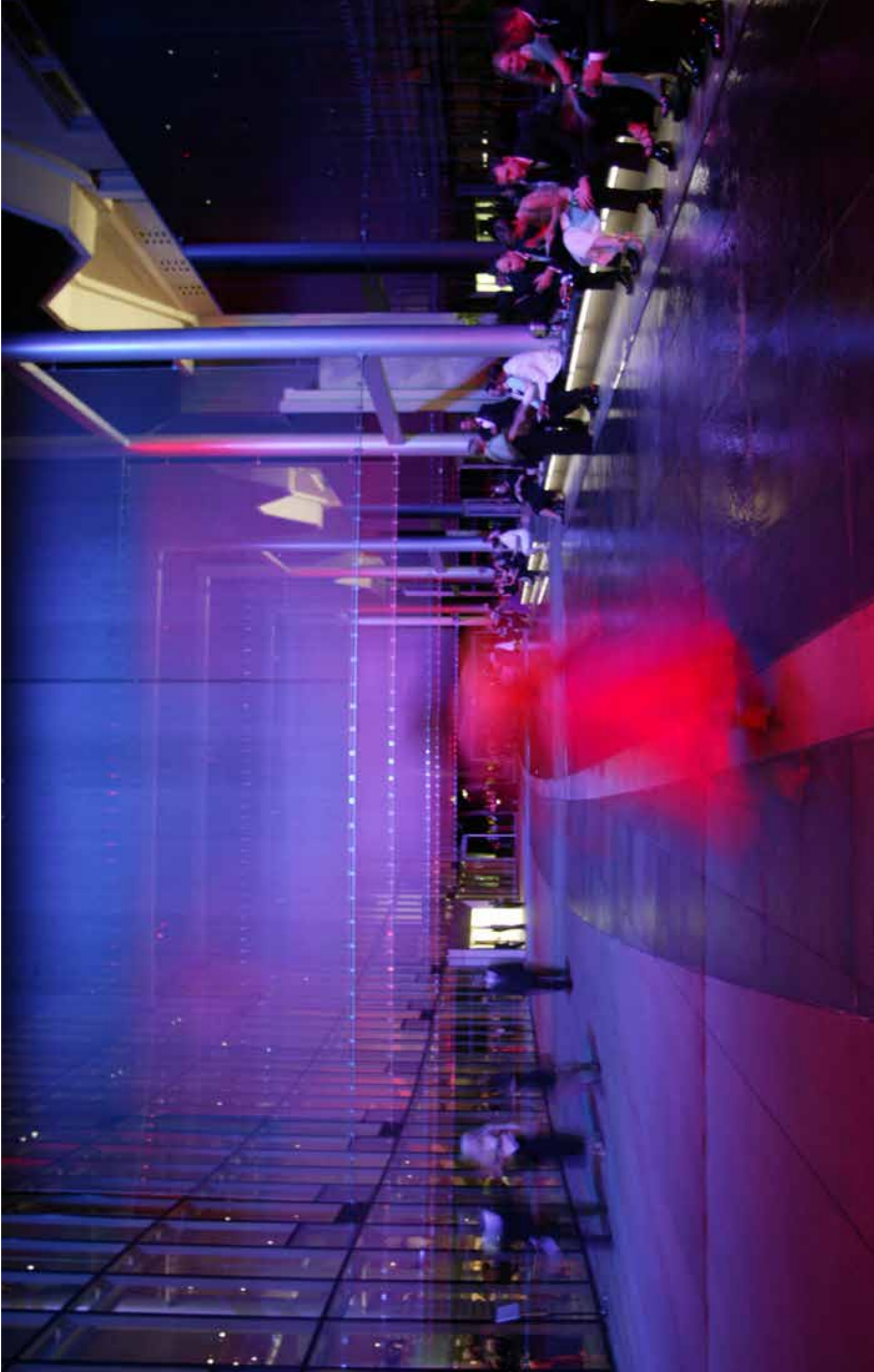
KRELSHEIMER PLAZA AT MARION O. MCCAW HALL, SEATTLE, WA