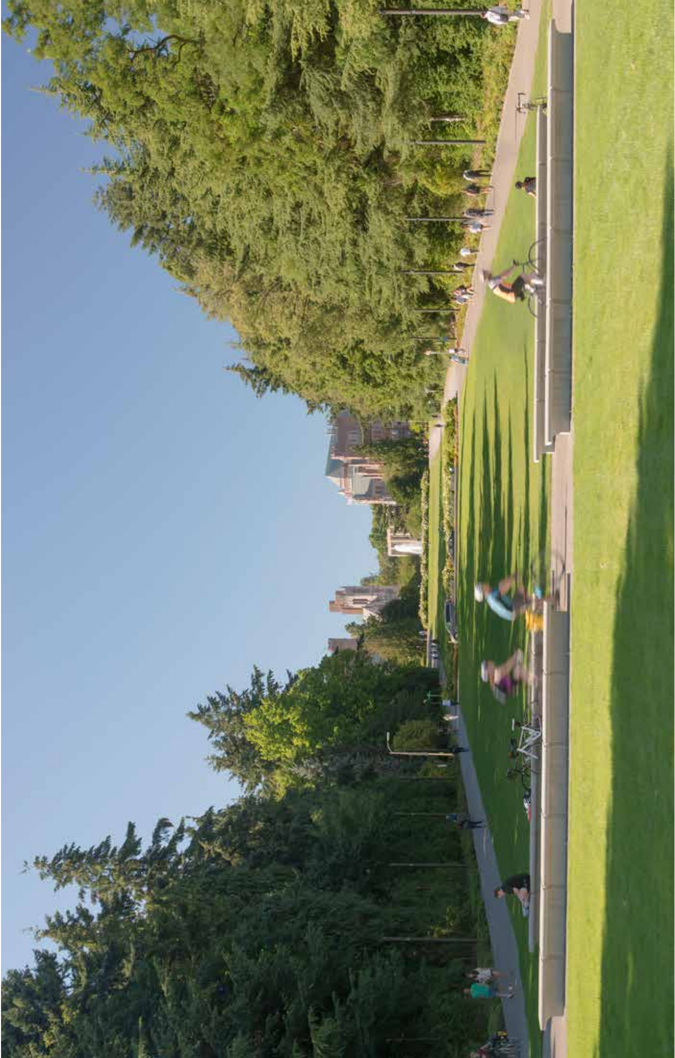
LOWER RAINIER VISTA & PEDESTRIAN LAND BRIDGE, SEATTLE, WA