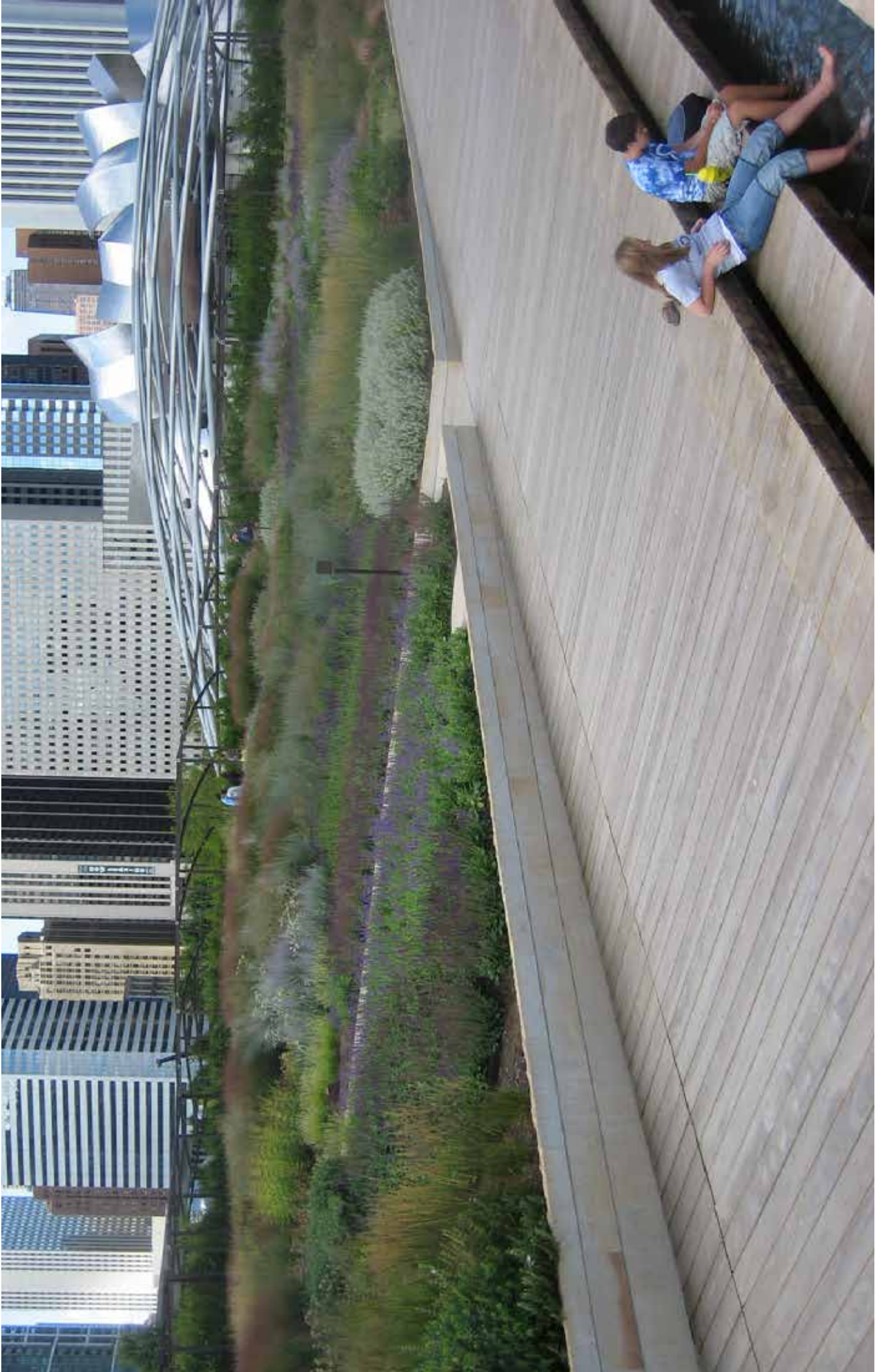
THE LURIE GARDEN AT MILLENNIUM PARK, CHICAGO, IL