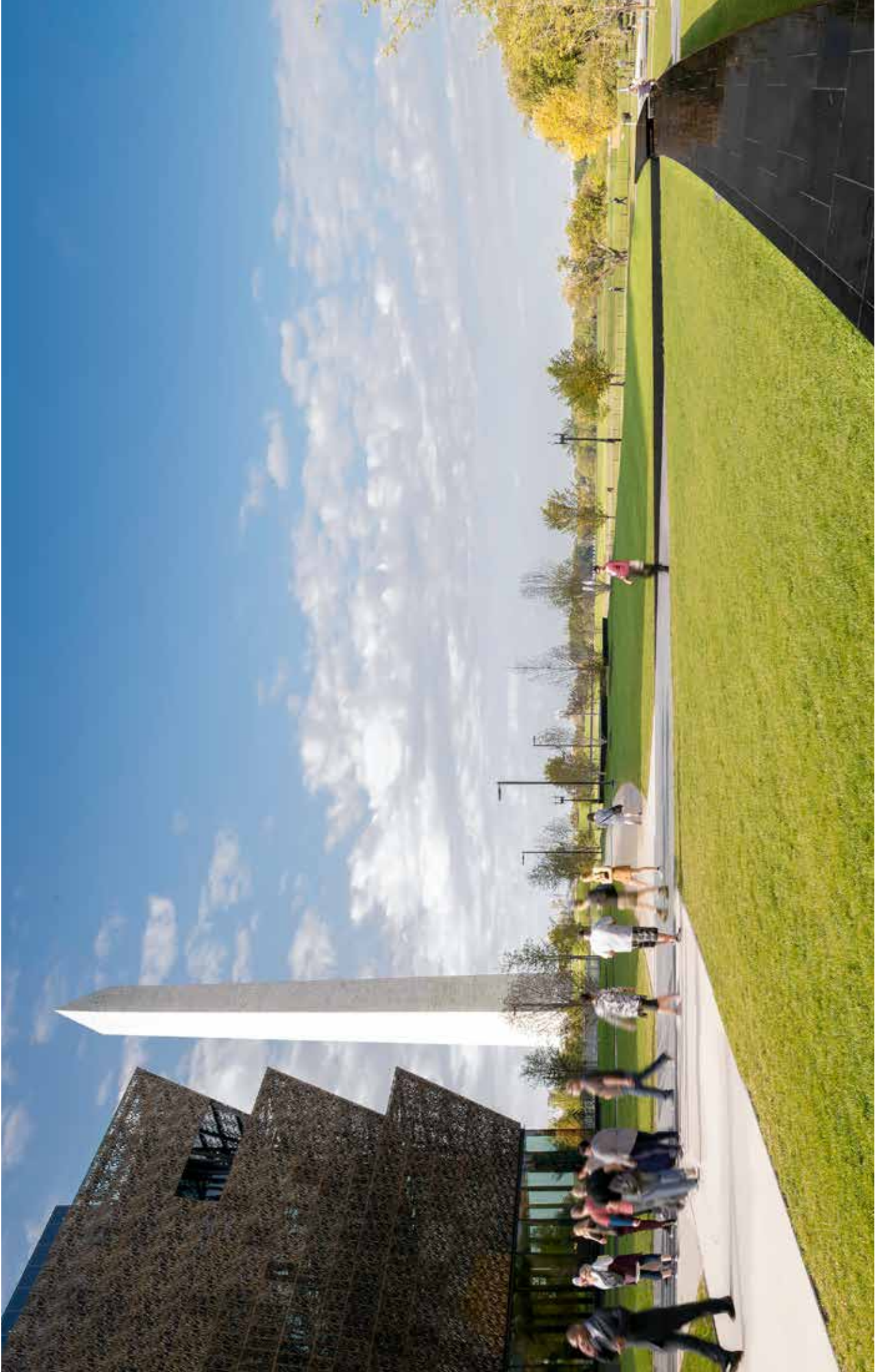
NATIONAL MUSEUM OF AFRICAN AMERICAN HISTORY AND CULTURE, WASHINGTON, DC