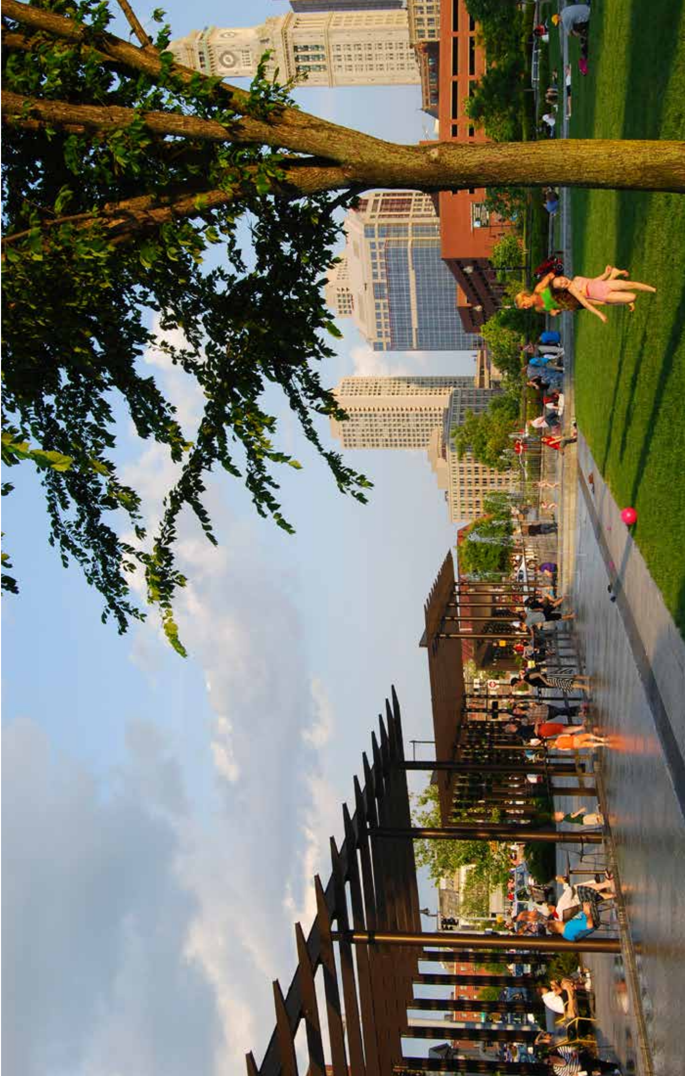
NORTH END PARKS, BOSTON, MA