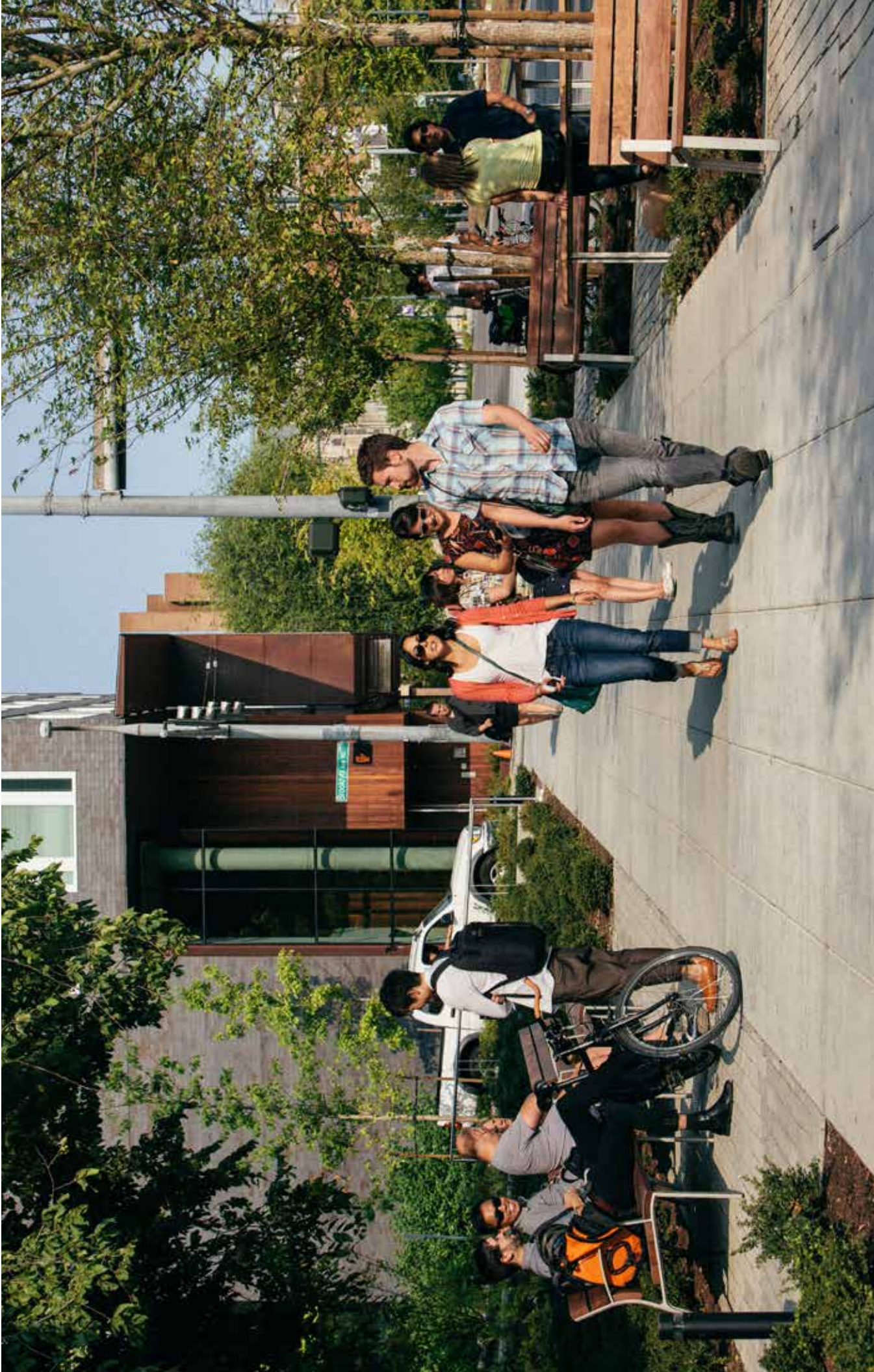
WEST CAMPUS STREETSCAPE, UNIVERSITY OF WASHINGTON, SEATTLE, WA