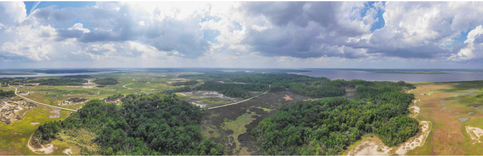
Coosaw Cotton Field on St Helena Island