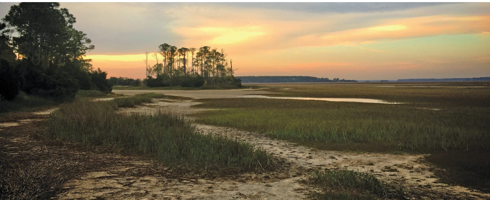
The Meeting of Marsh and Land in the Low Country