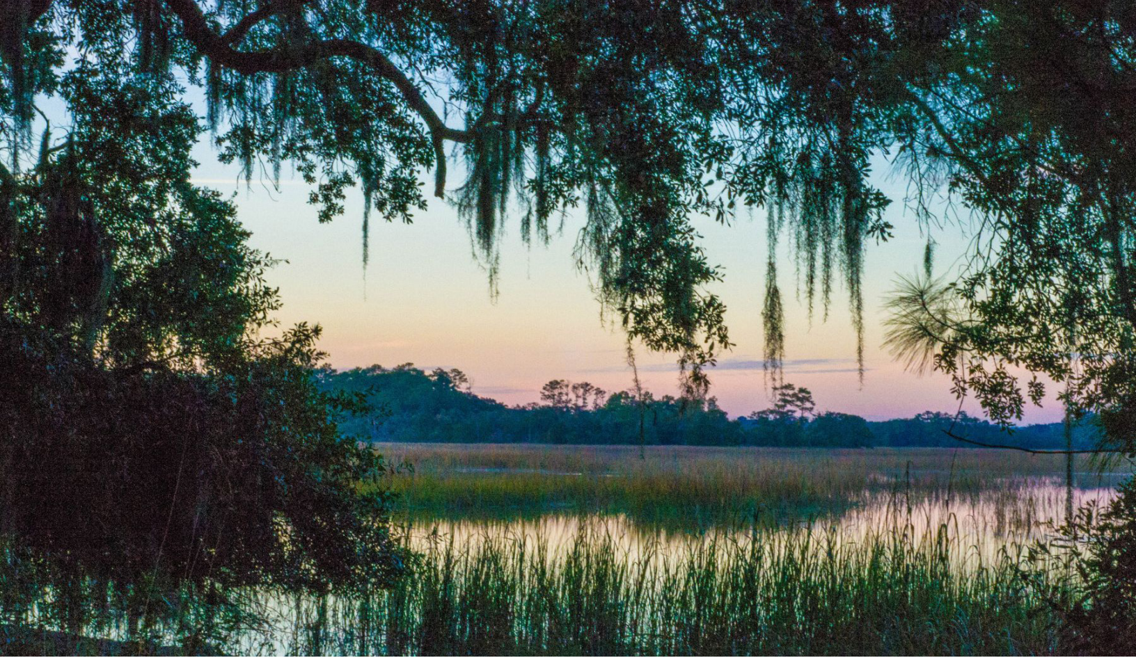
Spring Island, South Carolina