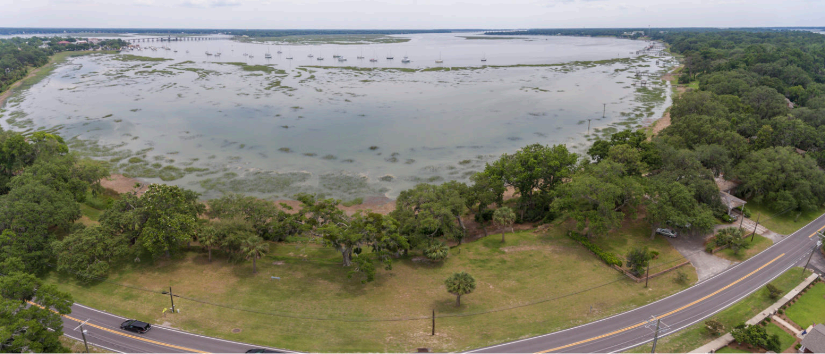
The Bluff Beaufort, South Carolina