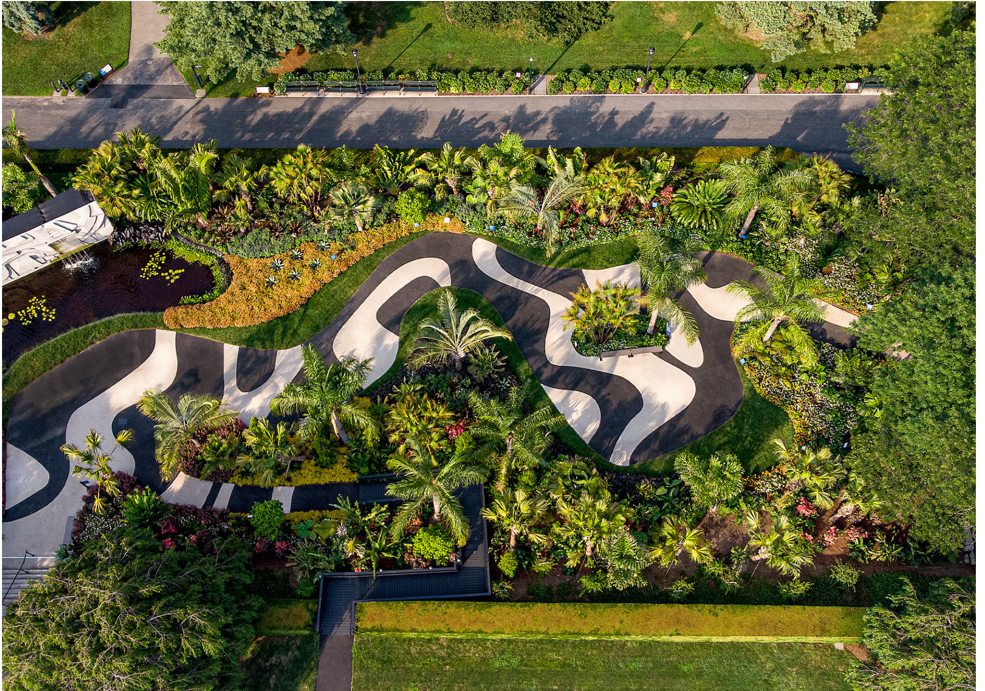
The Modernist Garden Bronx, New York