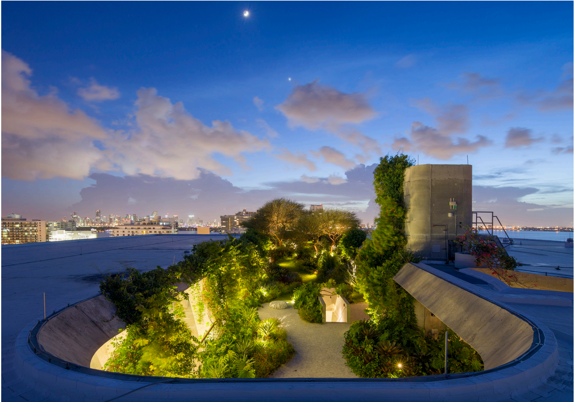
Sky Garden Miami Beach, Florida