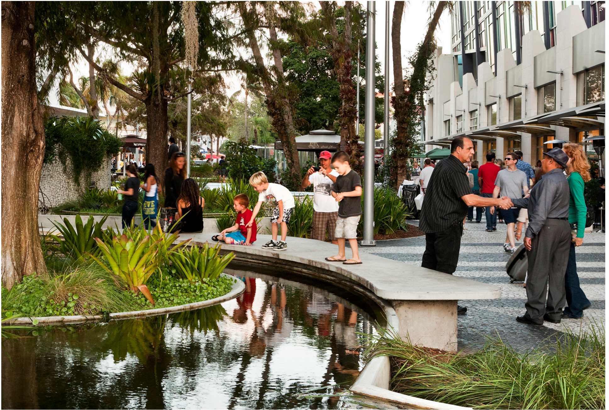
1111 Lincoln Road Mall Miami Beach, Florida