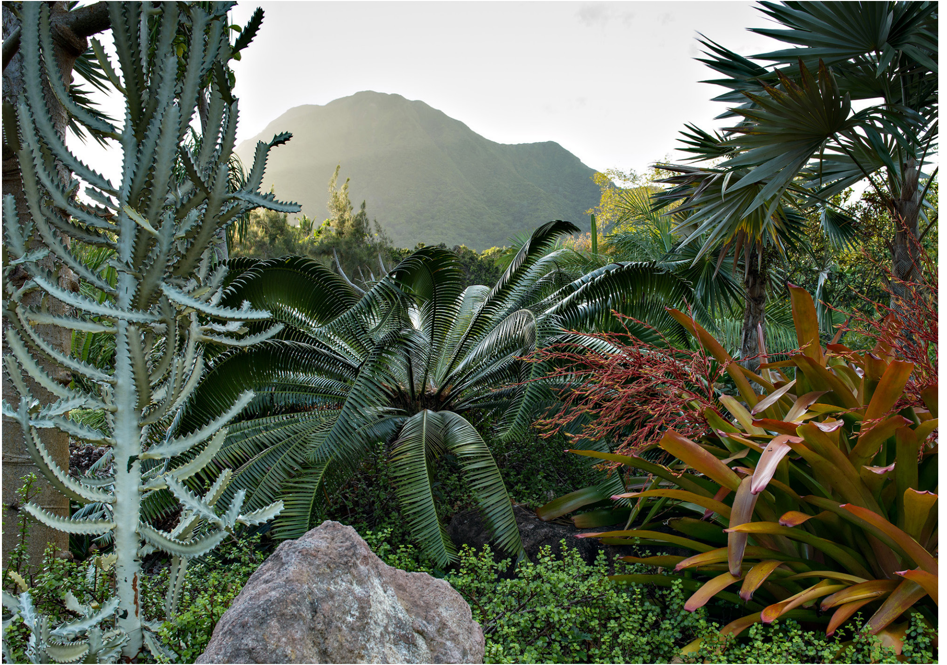
Golden Rock Inn Nevis, West Indies