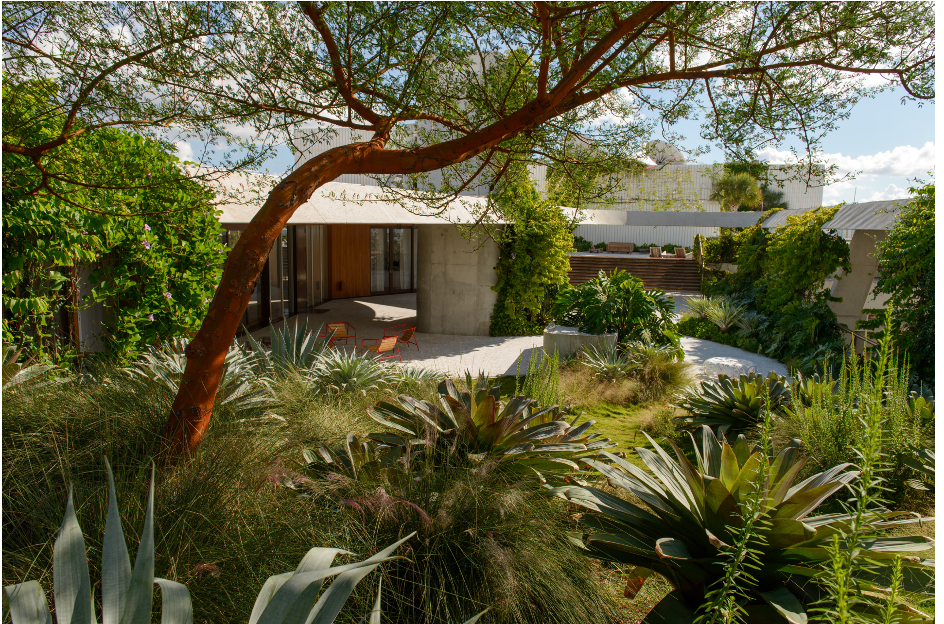
Sky Garden Miami Beach, Florida