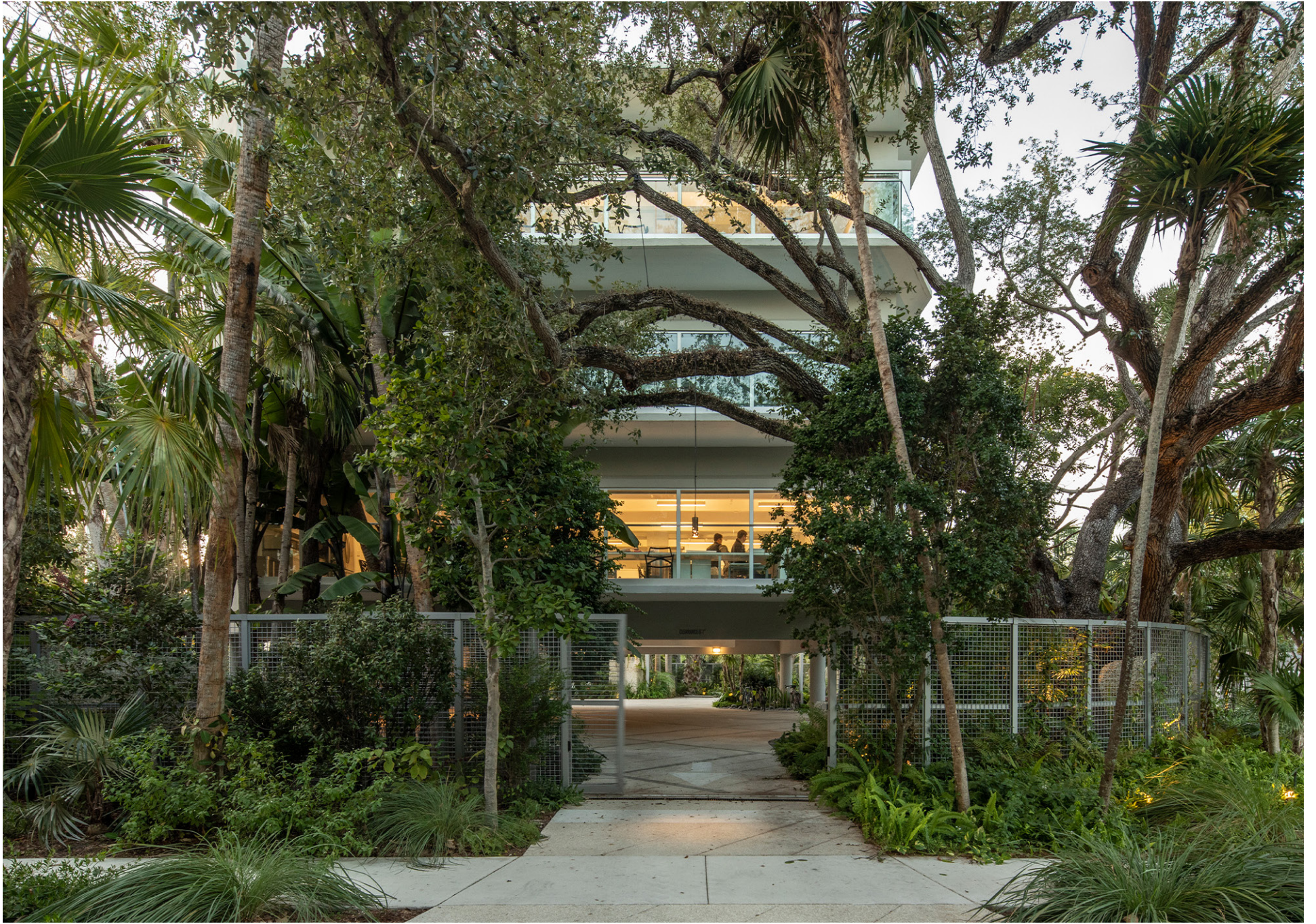
Grove Studio Garden Coconut Grove, FL