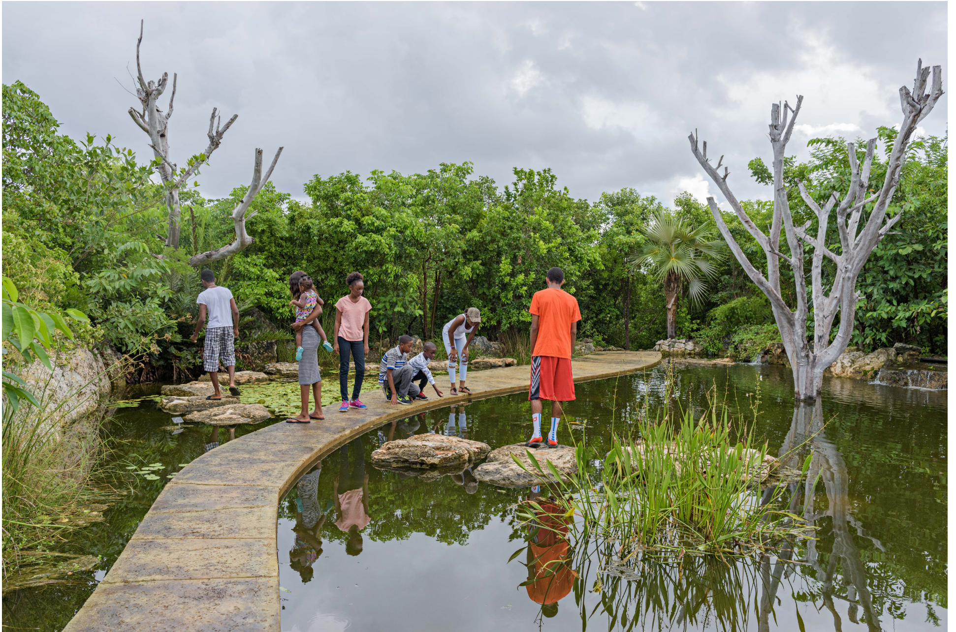
Leon Levy Native Plant Preserve Eleuthera, Bahamas