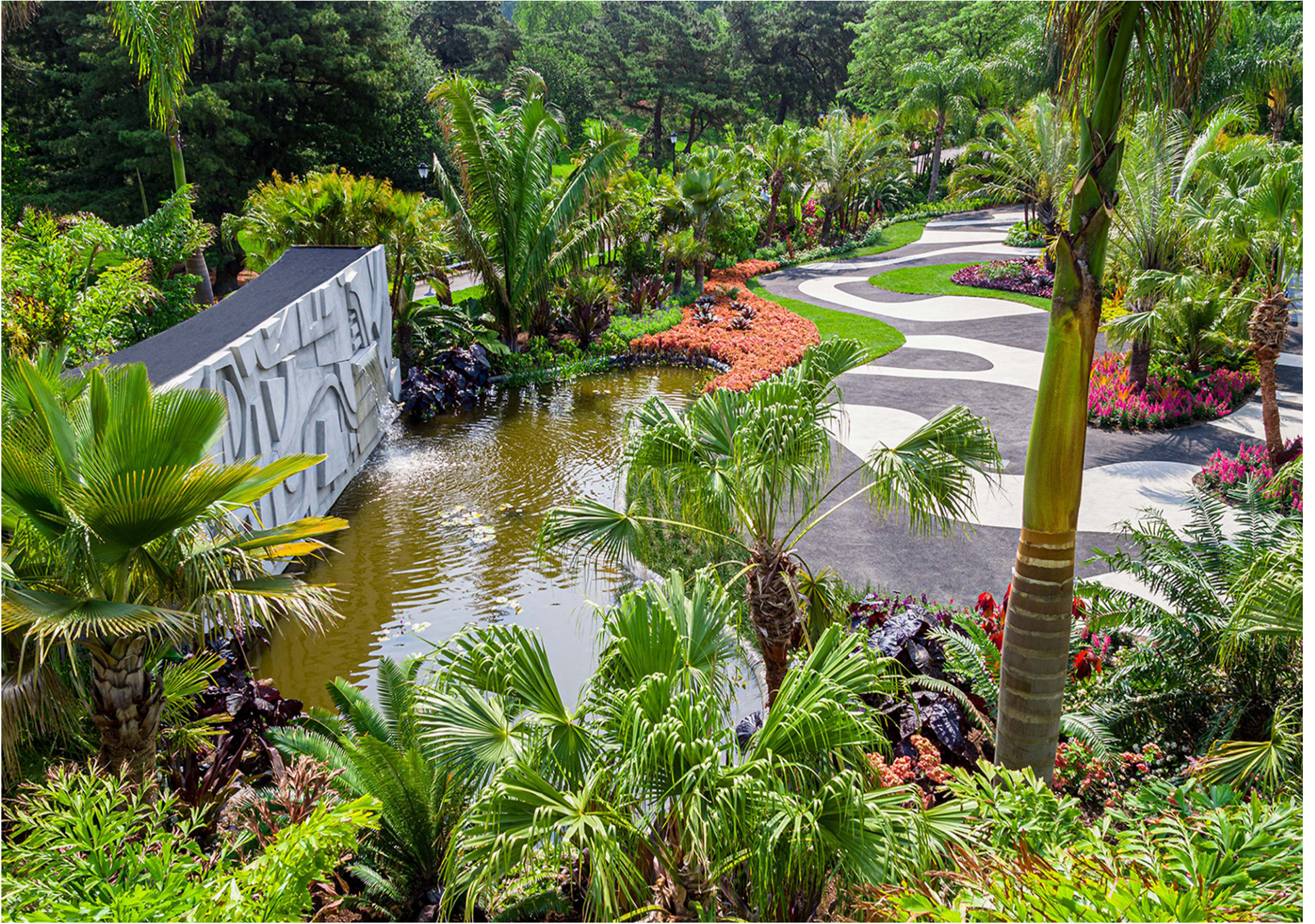
The Modernist Garden Bronx, New York