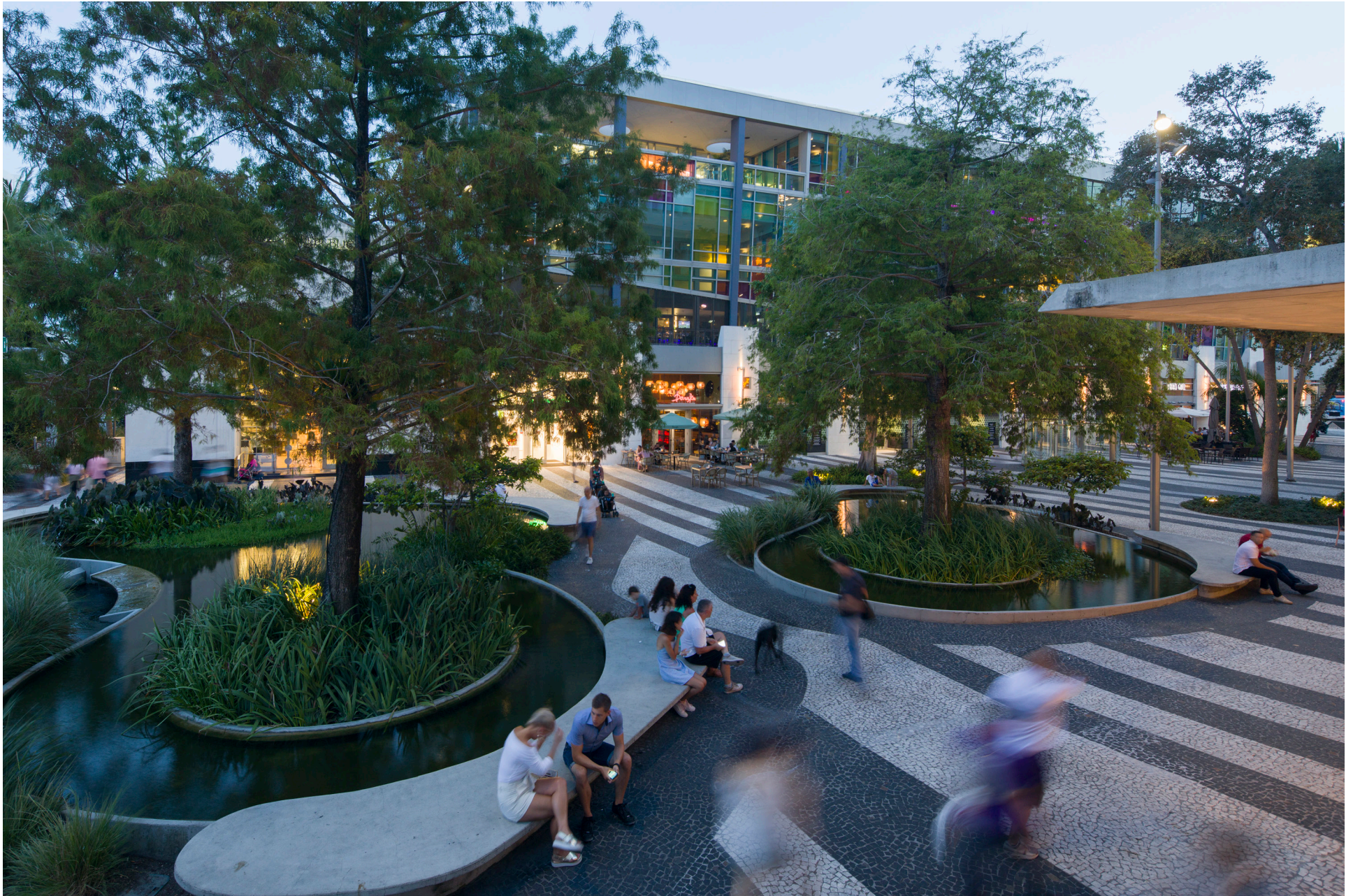
1111 Lincoln Road Mall Miami Beach, Florida