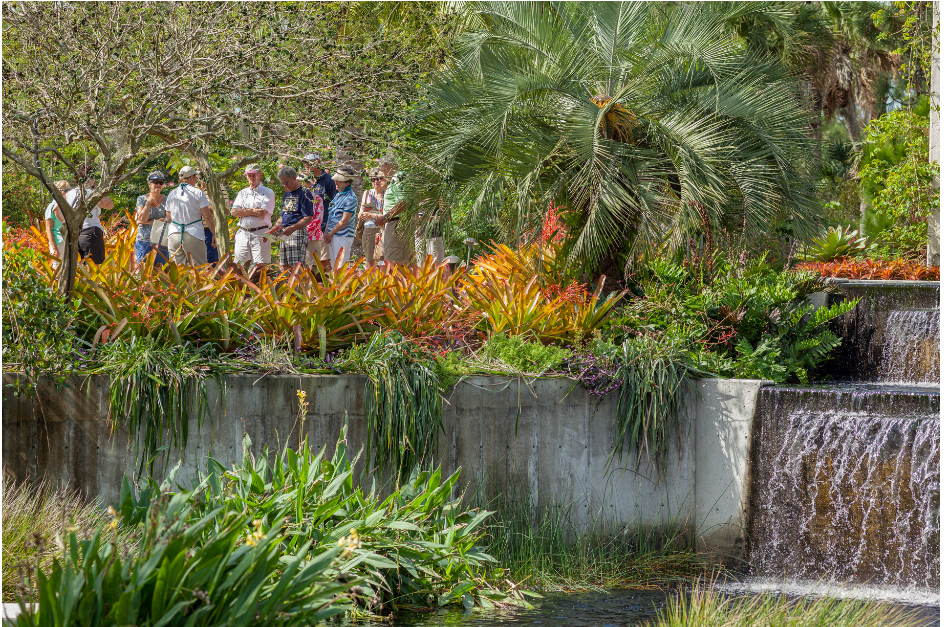
Brazilian Garden at Naples Botanical Garden Naples, Florida