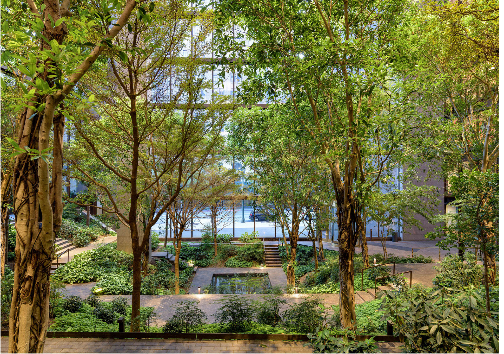
Ford Foundation Center for Social Justice New York, New York