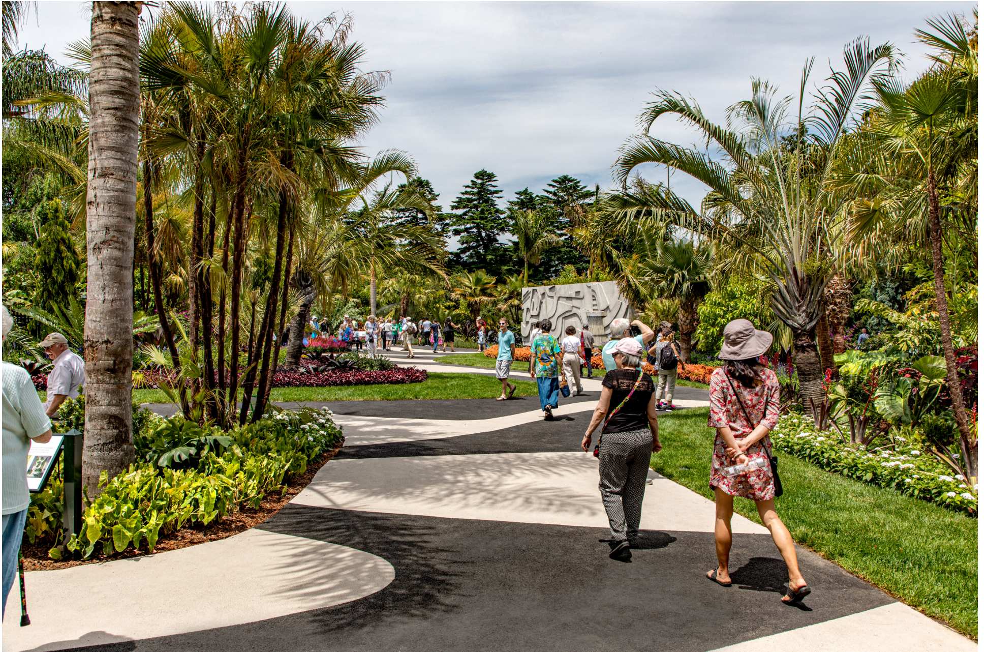
The Modernist Garden Bronx, New York