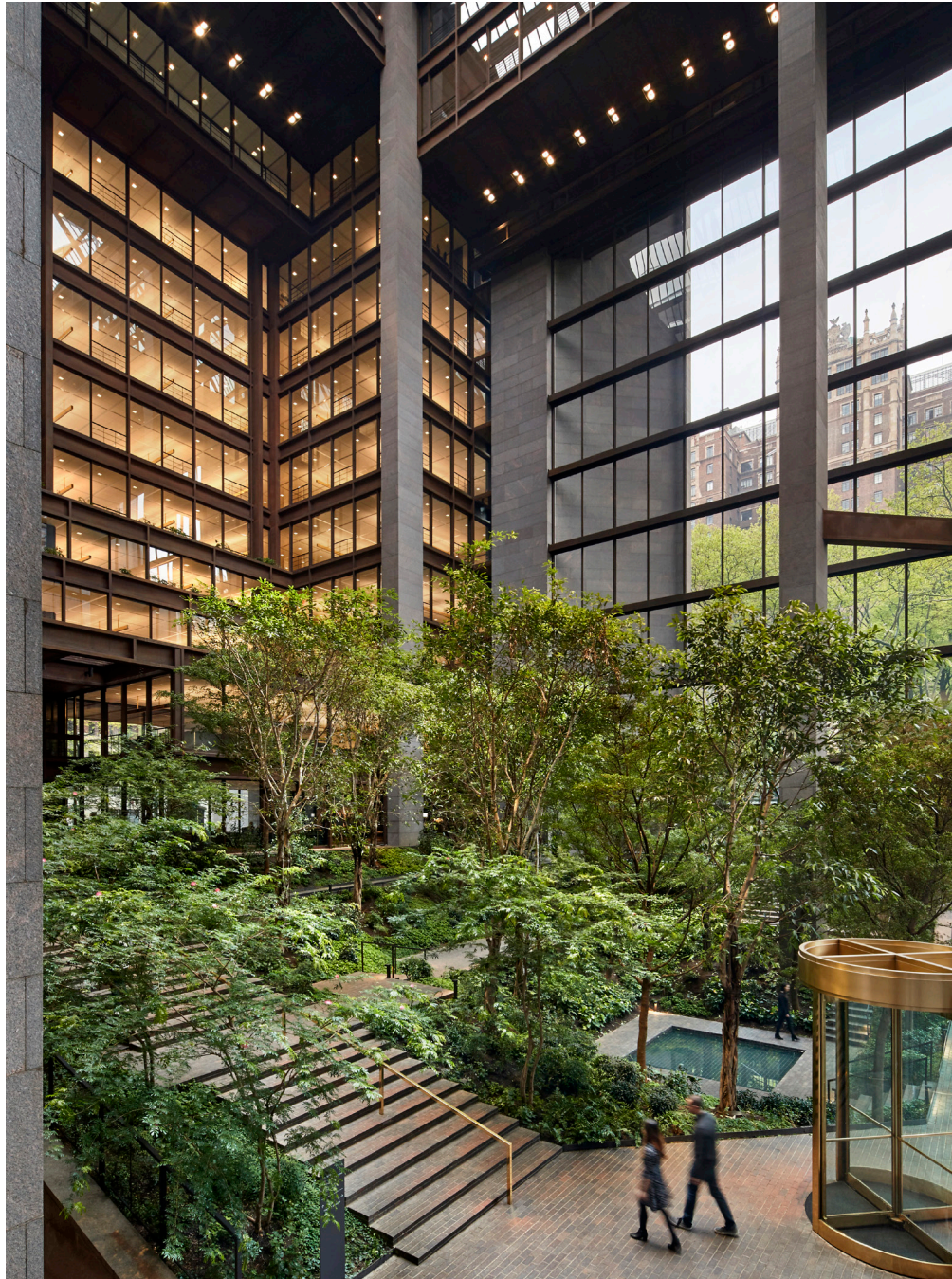
Ford Foundation Center for Social Justice New York, New York