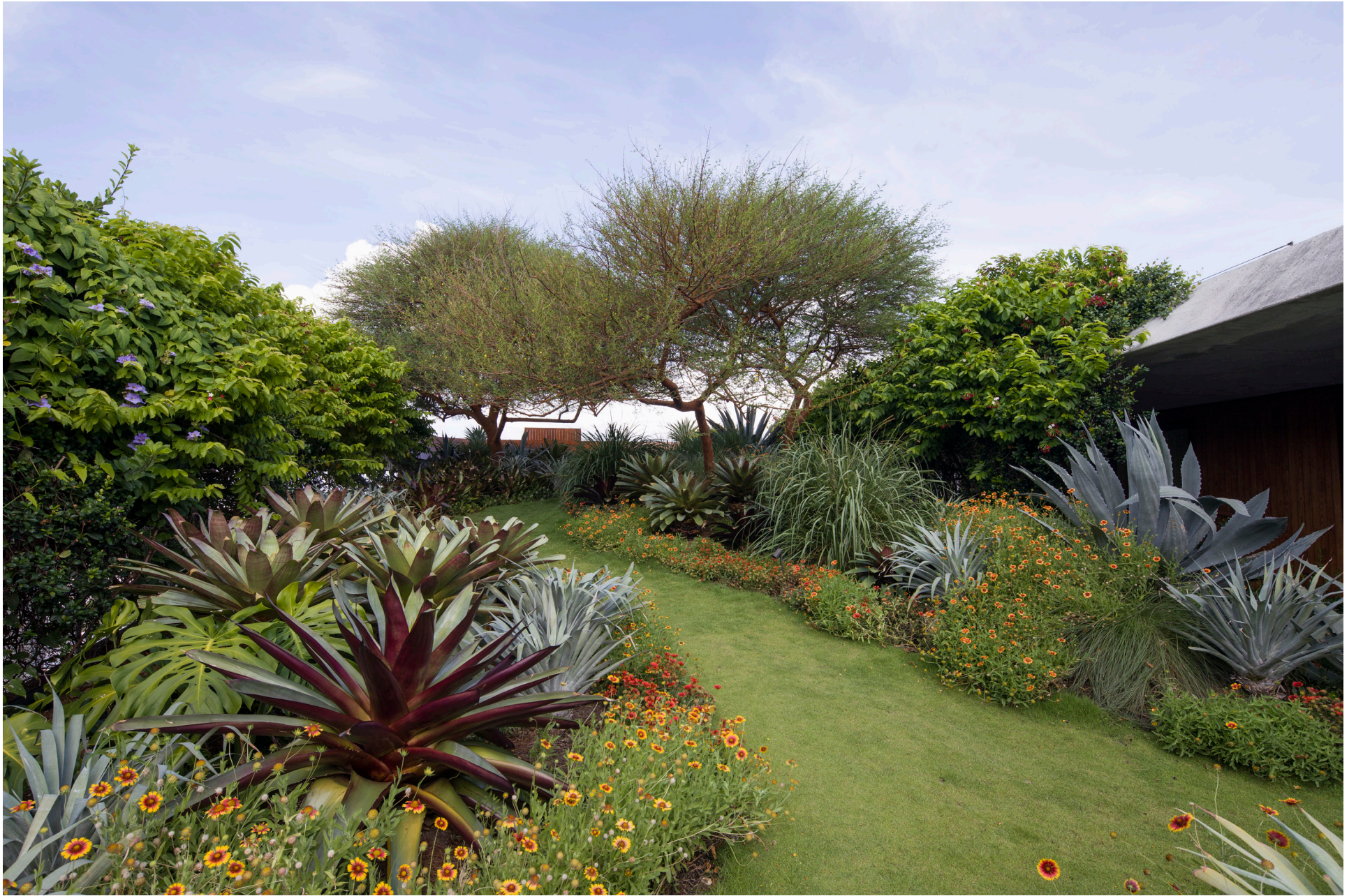
Sky Garden Miami Beach, Florida