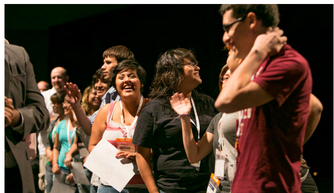
2012 Annual Meeting & EXPO, Phoenix