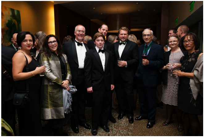
2013 Class of Fellows, Investiture Dinner, Boston, MA.