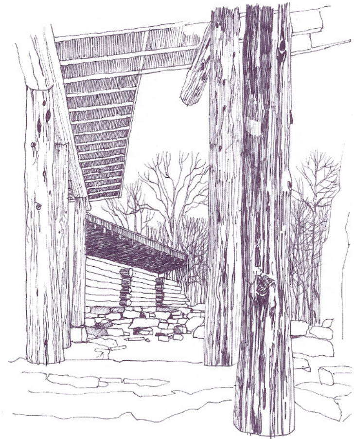
Oversized vertical structural elements