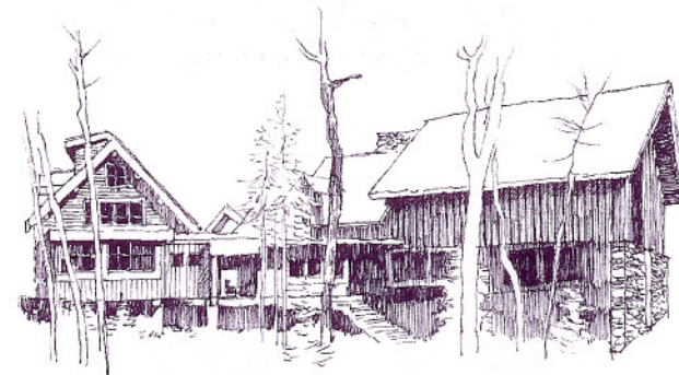
Trees thinned to protect view, but not completely cleared from the site