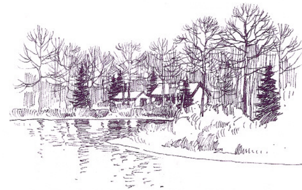
Natural shoreline appearance