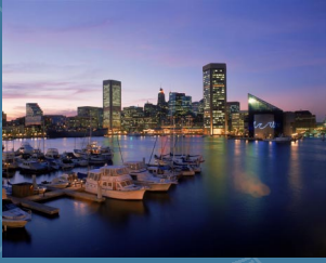
Baltimore Inner Harbor, MD