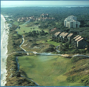
Amelia Island, FL