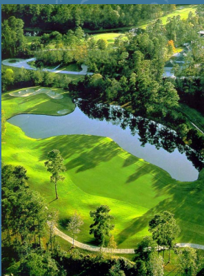
Woodlands New Community, TX