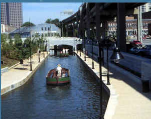
Richmond Canalwalk, VA