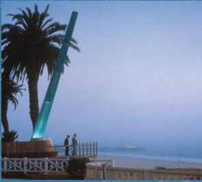
Santa Monica Beach Improvements, CA