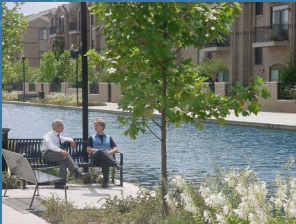
Capital City Landing - North Extension, IN