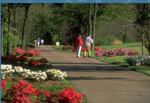
Brown Park, KY