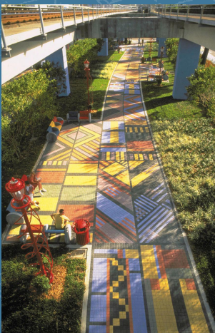
Overtown Mall, FL