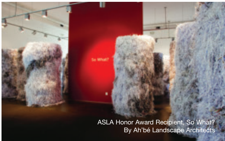
ASLA Honor Award Recipient, So What? By Ah'bé Landscape Architects

* Chapter dues are required for U.S. members in these categories at a cost determined by each chapter.