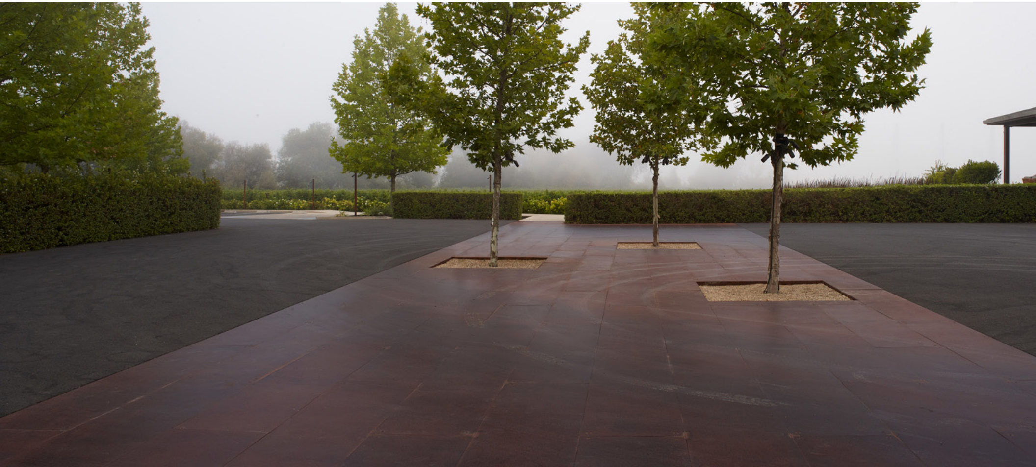
ALPHA OMEGA WINERY Rutherford, CA, 2007