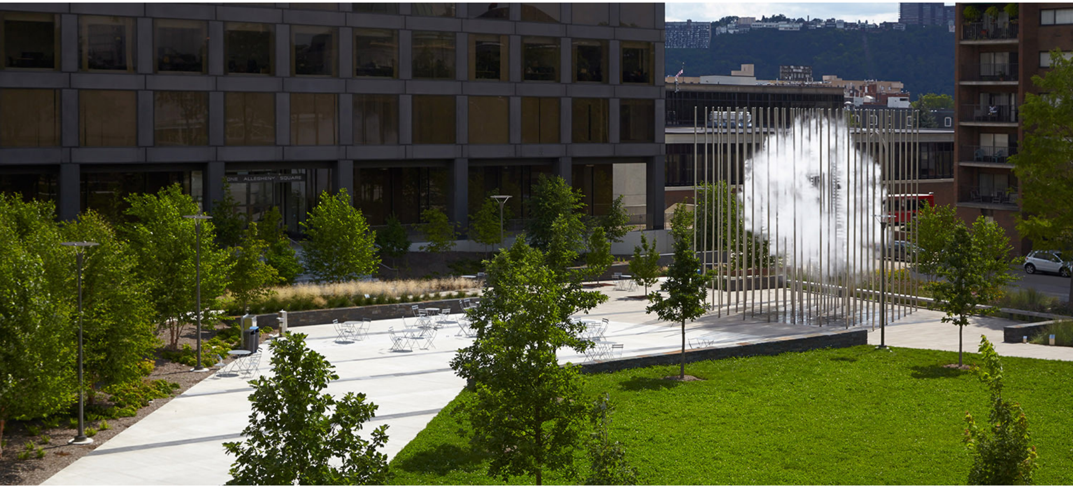
BUHL COMMUNITY PARK Pittsburgh, Pennsylvania, 2012