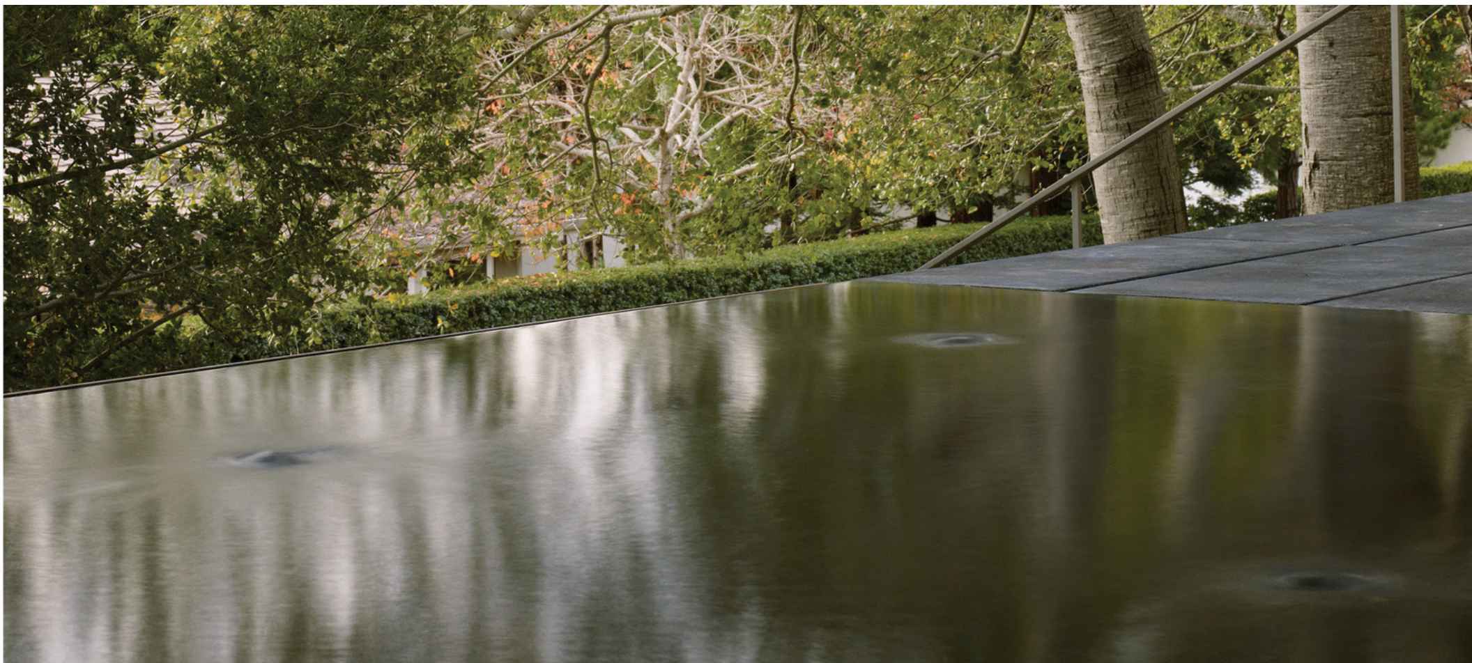
PENISULA RESIDENCE Hillsborough, CA, 2007