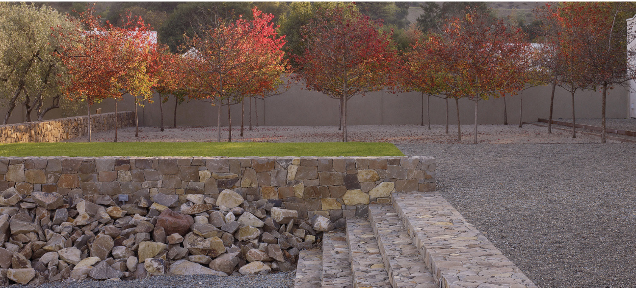
WALDEN STUDIOS Geyserville, CA, 2006