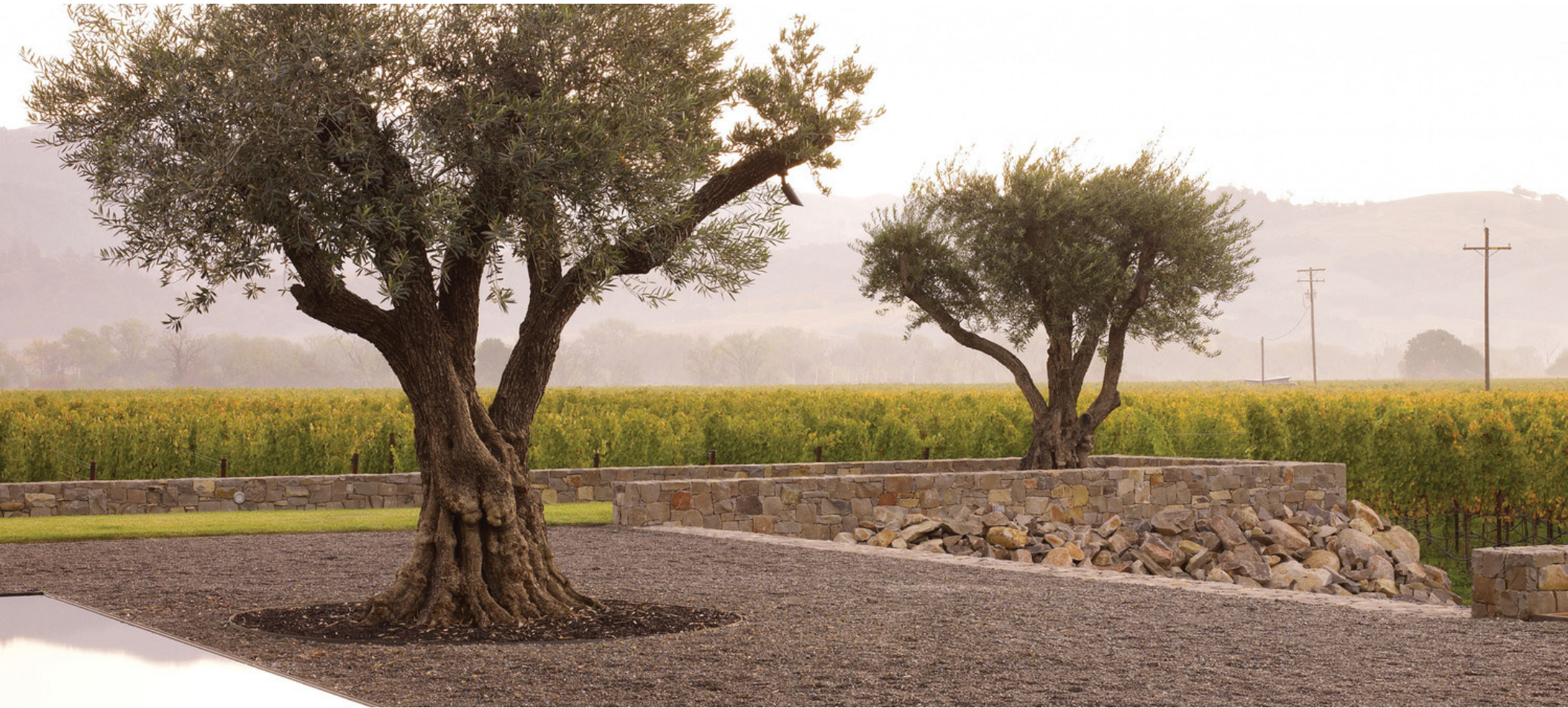
WALDEN STUDIOS Geyserville, CA, 2006