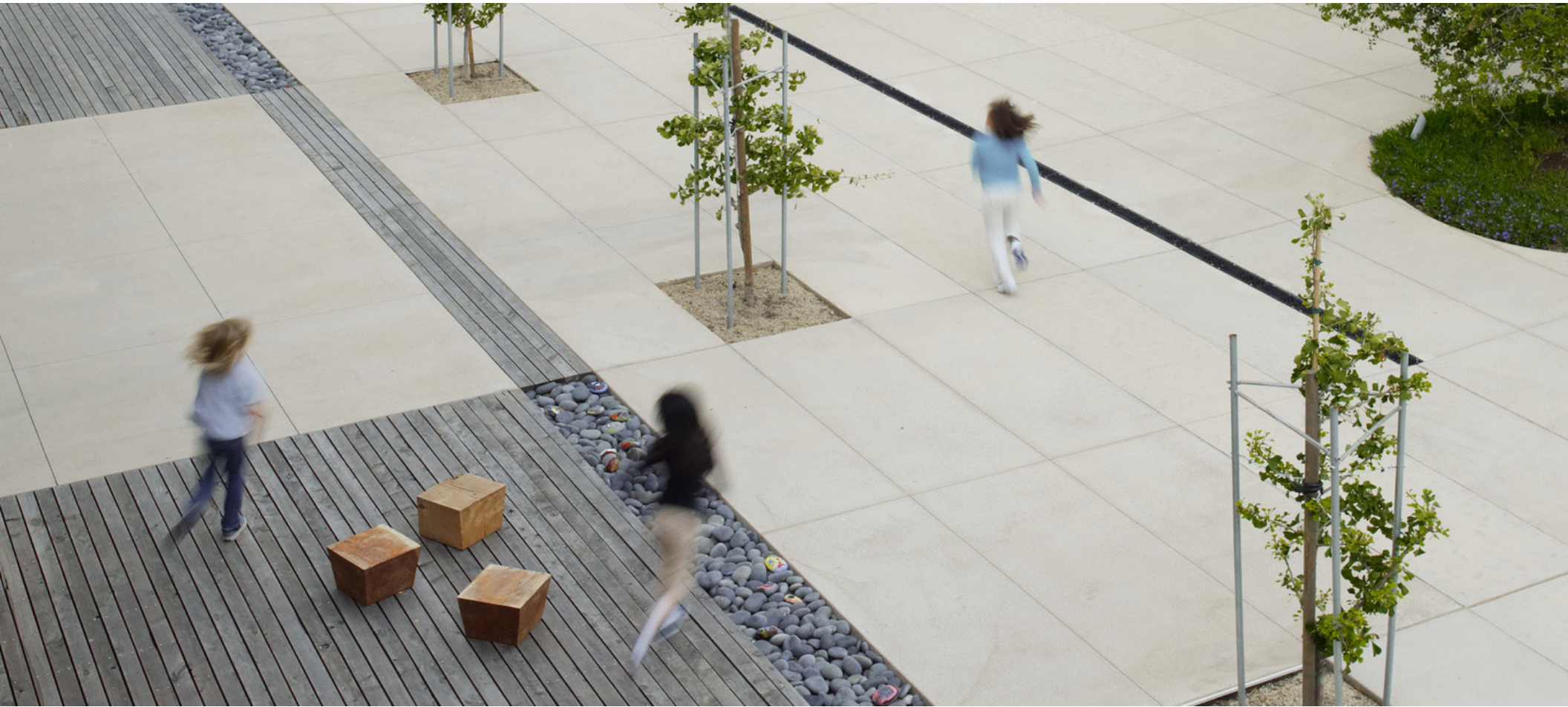
THE NUEVA SCHOOL Hillsborough, CA, 2007