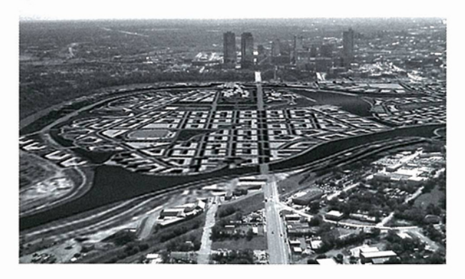
Left: Trinity River Vision Authority, Trinity River Bypass Channel, before, Fort Worth, Texas, 2003.

By their nature, complex adaptive systems are not static. They continue to grow, deepen, and become ever more complex. At times the process requires more than just inter-